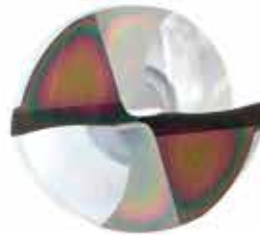
Unique End Cut Geometry